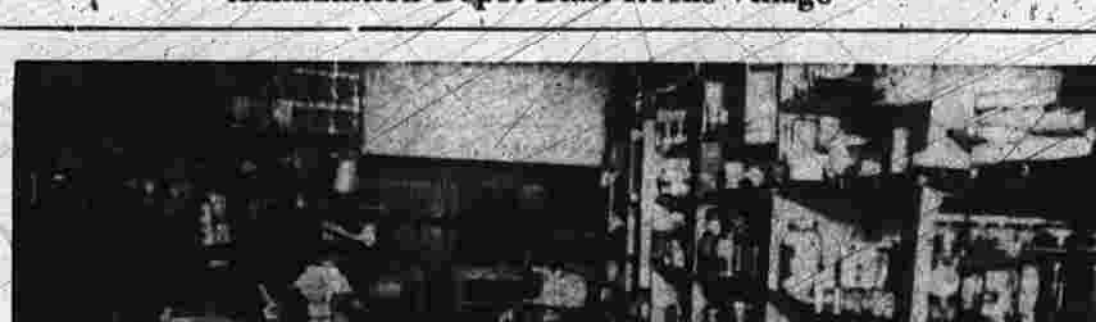
Axis forces fleeing from Odessa today; siege arc tightened.

Moscow, April 8.—(AP)—Germans and Rumanians were reported in flight from Odessa today, as the Russian Army drew tight a siege arc which pressed as close as 9 1/2 miles to the northeast of the long-black sea port, scene of a long-drawn Soviet resistance in 1941. A dispatch by Capt. Konstantin Tokarev to Red Star said one group of Gen. Rodion Y. Malinovsky's Third Ukrainian Army caught an enemy column hurrying from the city along a narrow muddy road northwest of the port and ordered it to halt.